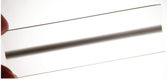
Linear Apodizing filter, Dark in center

Inserting a customizable linear apodizing filter eliminates undesirable intensity variations